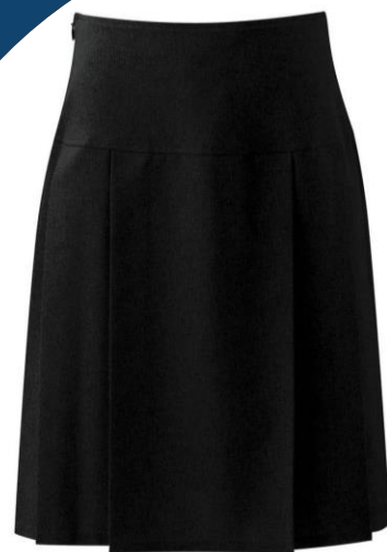
Known as: ' Henley ' Banner flat front, pleated skirt

This skirt purchased from either Paul Day's of Ely or Price and Buckland will meet the school's expectations but it is important height is considered to ensure correct length.