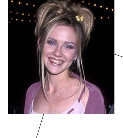
Light/pale complexion, accompanied with pink toned shiny lipstick on the inside and a darker lip liner around lip

More noticeable contour, with a warm and cool toe shades, blush and highlighter all blended together to give a flawless look. Base is full coverage and same or little darker than face skin tone